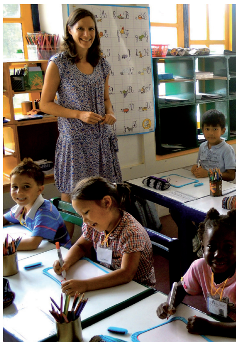
French school of Kathmandu

The schools are required to periodically justify their compliance with the accreditation criteria (enrollment of both French children and foreign children, preparation of pupils for French exams and diplomas, presence of French tenured staff, etc.).