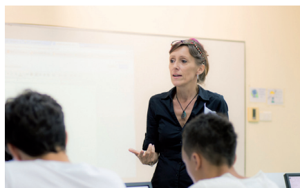
French high school of Singapore

Preparing for PROGRAMS OF ACADEMIC EXCELLENCE .