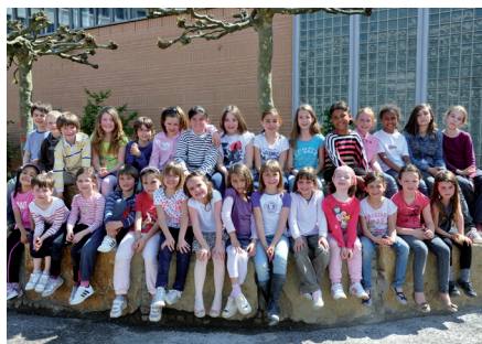
French school of Saarbrücken

Granting income based SCHOLARSHIPS to French children in the network's schools.