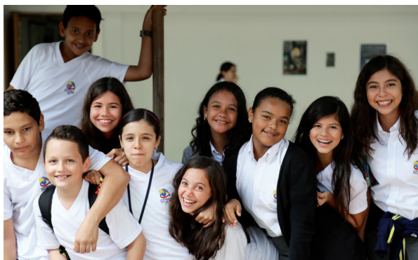
French high school Paul Valéry of Cali

This grant system is reserved for French pupils aged 3 or more, listed in the global registry of French nationals living abroad and attending a French school.