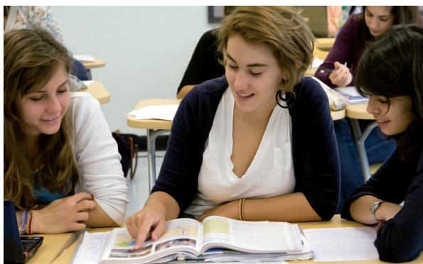
French international high school Rochambeau of Washington

France is the only country to have created an education system of this scale, abroad, and it receives significant government funding.