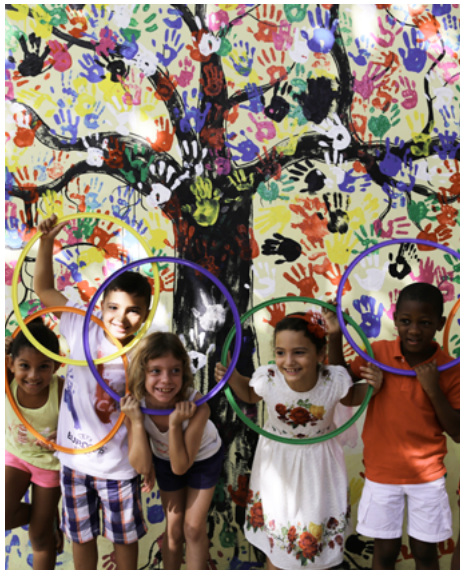
Montaigne french school, Cotonou, Benin