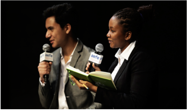
Final of the 6th edition of Ambassadeurs en herbe 2018, Théatre Paris-Villette, on May 3 and 4, 2018.

442 CONSULAR ADVISORS (in 130 divisions)